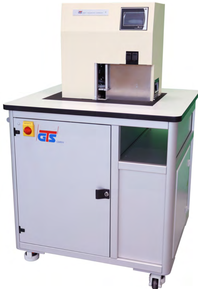
Note counting machine