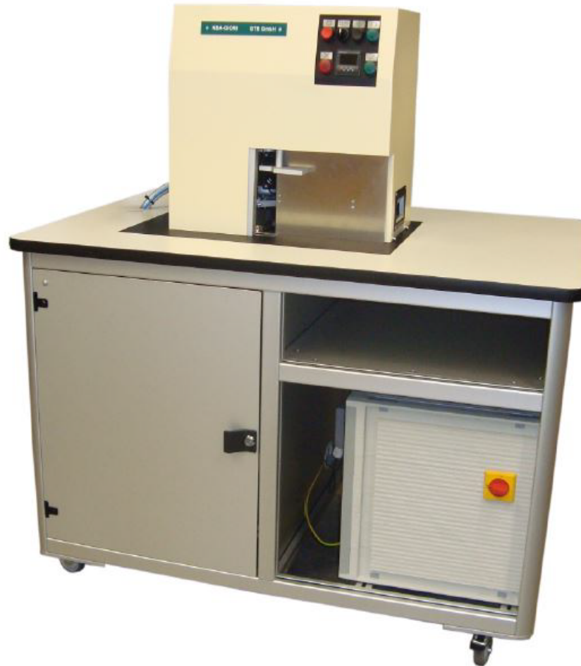
Note counting machine